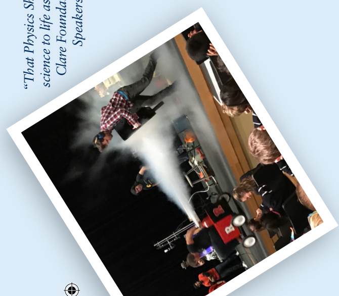
“That Physics Show” brings science to life as part of the Clare Foundation STEM Speakers Series.